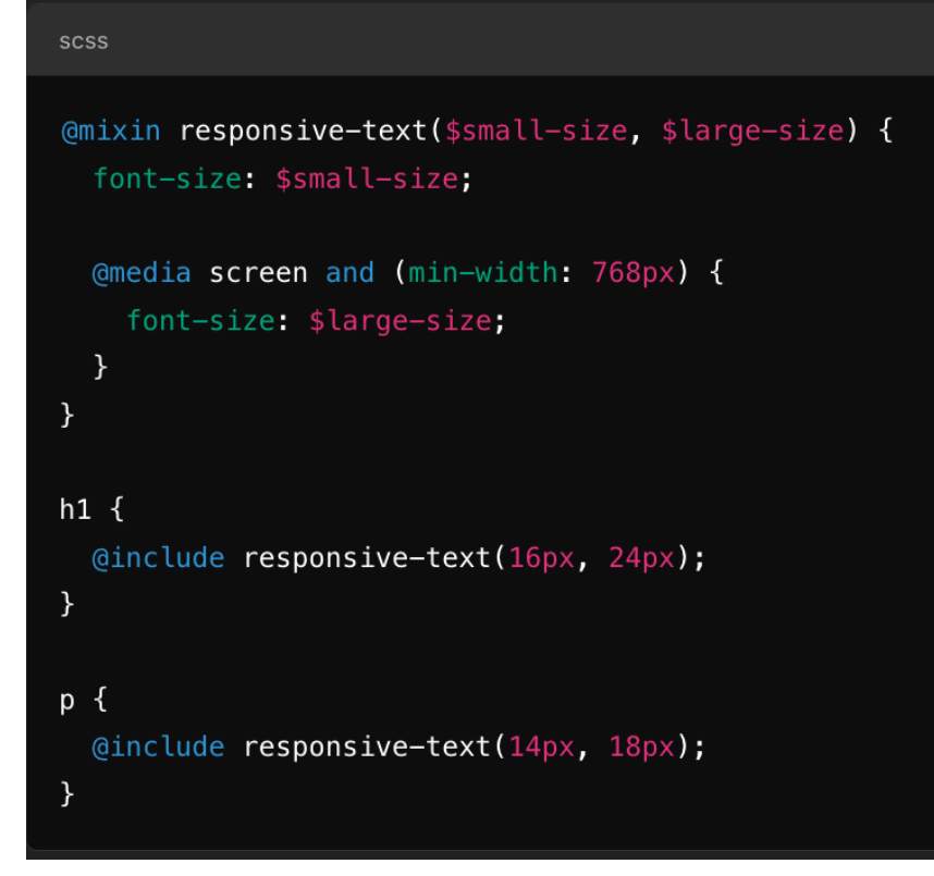
Mixin with Media Queries