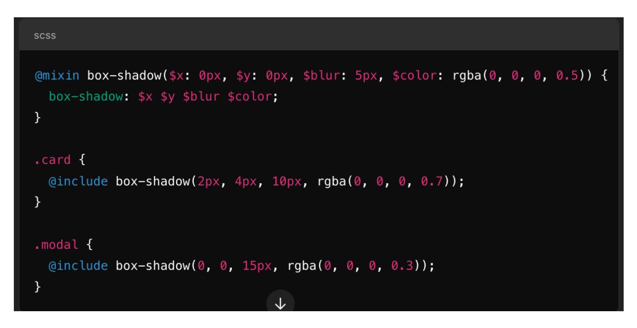
Mixin for a box-shadow

• Example 1: Creating a Box Shadow Mixin